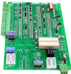
Apollo 635: R-0101