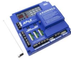
APeX Control Board: R-0160 DC Motor Board: R-0157 NOT PICTURE: APeX AC Power Box: R-0162