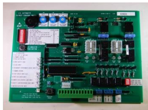
US Automatic Patriot Board: R-0173