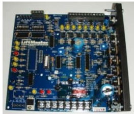
Chamberlain Control Board: VPL R-0128 (custom AG Chip Ver. 6.24A) Chamberlain Control Board: MEGA Arm R-0112 (same board, factory chip)