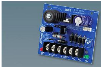
SMP-3 3 Amp Power Supply: O-0309