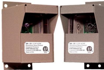
EMX UL-325 IFR Photo Beam: O-0238