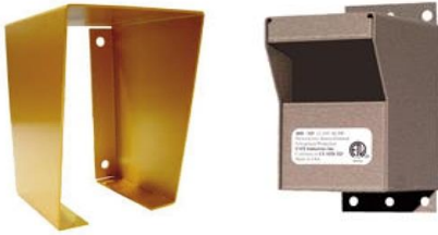
EMX 4X Hood: O-0233 EMX IRB-325 Hood: O-0236 NOT PICTURED: EMX Mounting Bracket: T-0507