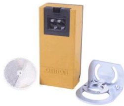
OMRON Reflector Phot Beam: O-0243