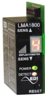
Loop Detector: EDI LMN-1800 (Plug-in): O-0123