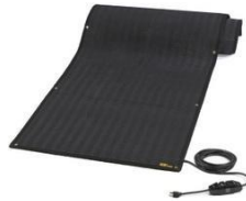
Heat Mat w/ Thermostat: 1' x 5' (Standard VPL) H-0403 2' x 5' (Crash SHIELD) O-0101