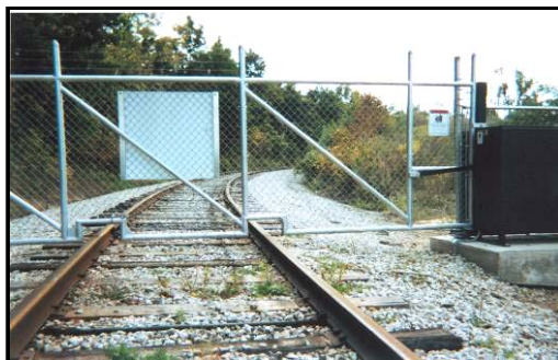
Custom Curb Notch