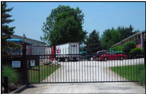
#700 - Saratoga