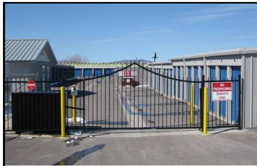
#800 - Prestigious