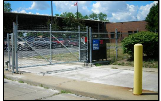
#300 - Chainlink