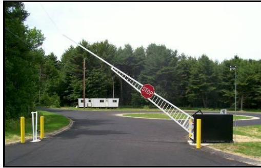
#200 - Barracuda