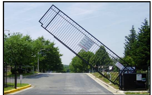
#900 - Ohioan