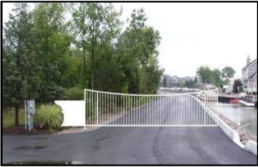
#400 - Catawba