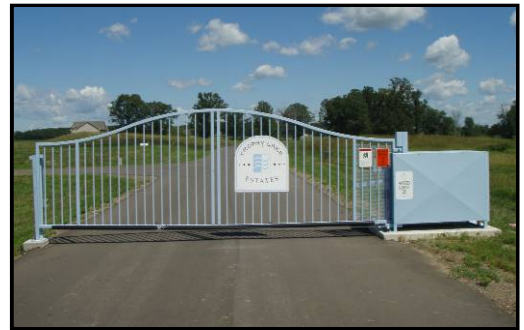
#600 - Congress