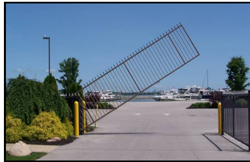
#500 - Buckeye