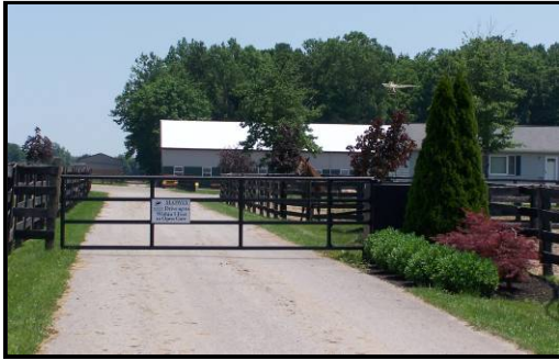
#100 - Cornhusker