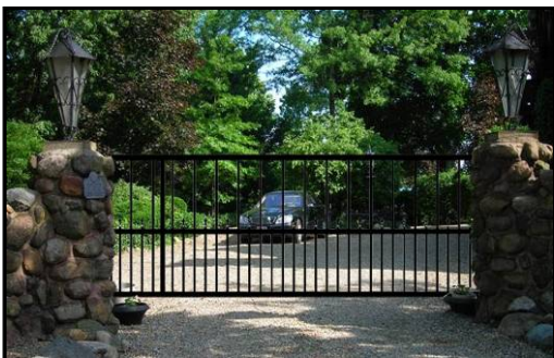
#1000 - Islander